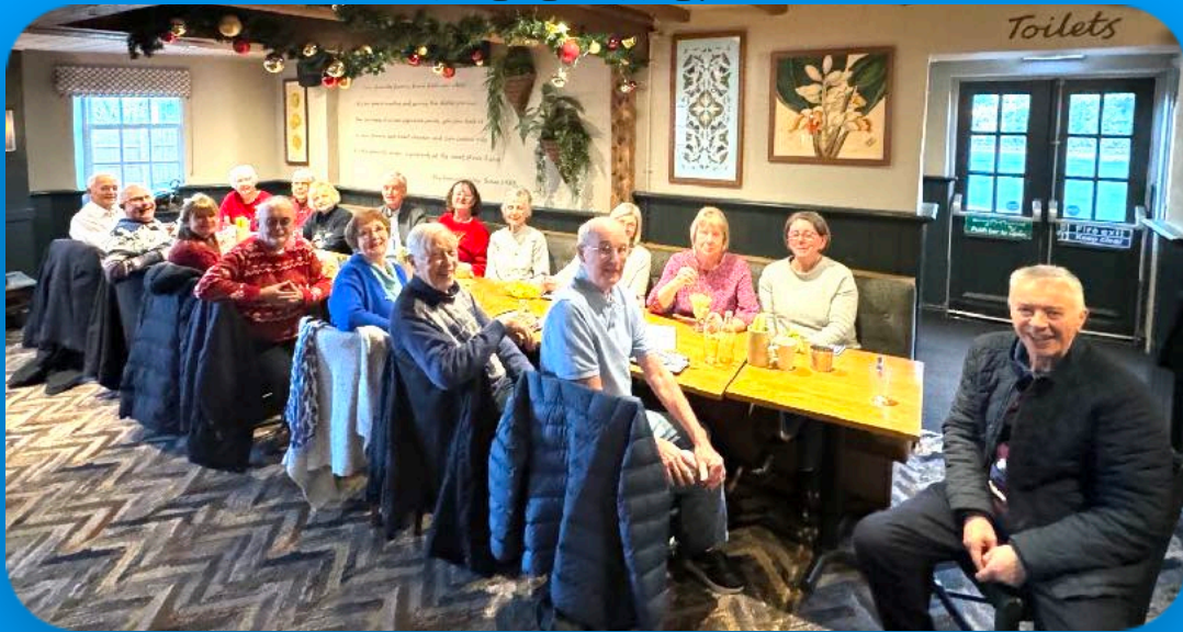
This Is A Joint Group with SW Herts